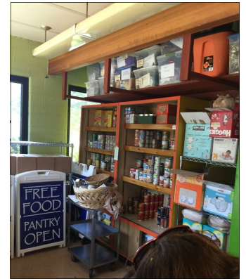
New Food Pantry

The new Gospel Band really added to the celebratory atmosphere