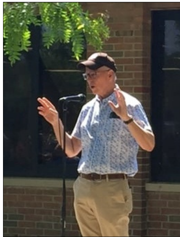
Mayor Ken Siver City of Southfield