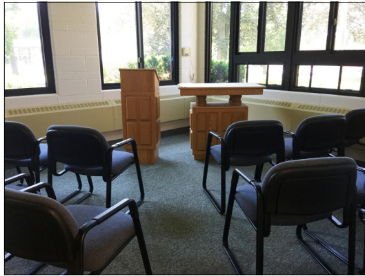
Our New Chapel